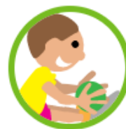
Skill Ball Skills