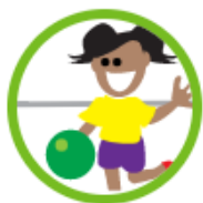
Game Throw Tennis