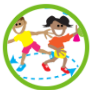
Warm-Up All Change