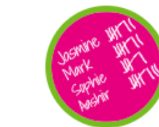
Review Method Secret Stats